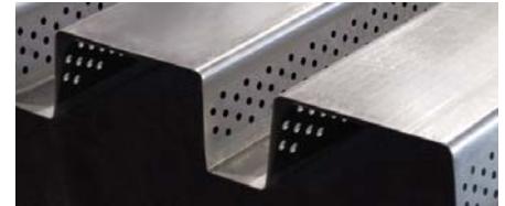
Type "N Acoustical" (long span perforated)

Helpful Hint: Type "N" deck is used when the support spacing exceeds the recommended spacing for "B" type deck.