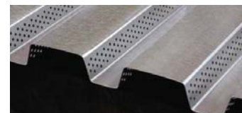
Type "B Acoustical" (wide rib perforated)

Helpful Hint: Type "B" deck is the deck of choice for the majority of roofing applications. It is our most commonly sold product.