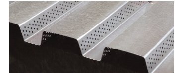
Type "B Acoustical" (wide rib perforated)

Helpful Hint: Type "B" deck is the deck of choice for the majority of roofing applications. It is our most commonly sold product.